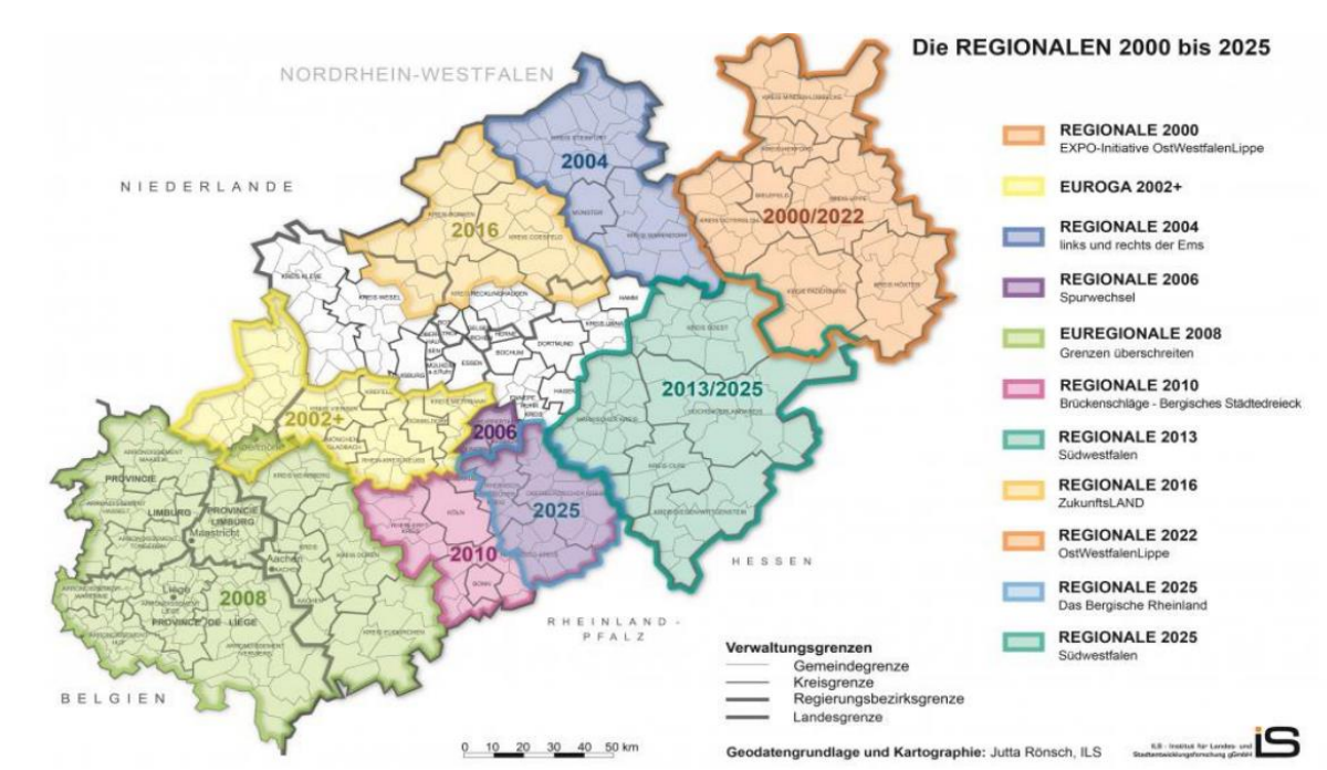
Detail 1: Die REGIONALEN in NRW

The REGIONALEN as a policy and planning approach aim at horizontal (public, private and civil society) and vertical (multi-scale) cooperation at the regional level. They are a unique instrument to enhance the basic spatial situation and to improve the (economic) performance of regions. Since 1999, the federal state of North Rhine-Westphalia has encouraged regions to define themes of regional interest and to work together in flexible intermunicipal partnerships. They are a good example of coordination and integration across sectors, planning levels and policy areas. Eleven REGIONALEN have been implemented, three of which are currently running until 2022/2025.